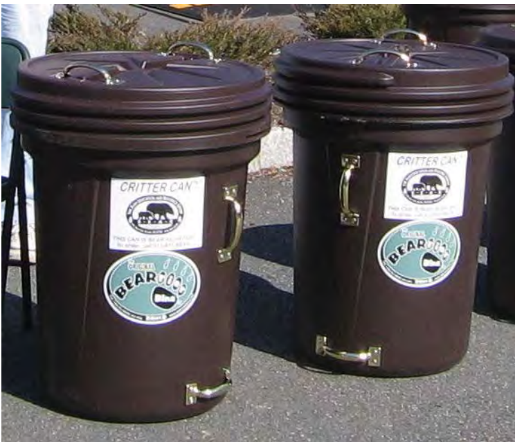
Bear-resistant trash bins, West Milford, New Jersey.

In New Jersey and Maryland, wildlife department spokespersons emphasize sport hunting as a means of separating bears and suburban residents and houses. Yet hunting officials elsewhere openly state what is common knowledge: