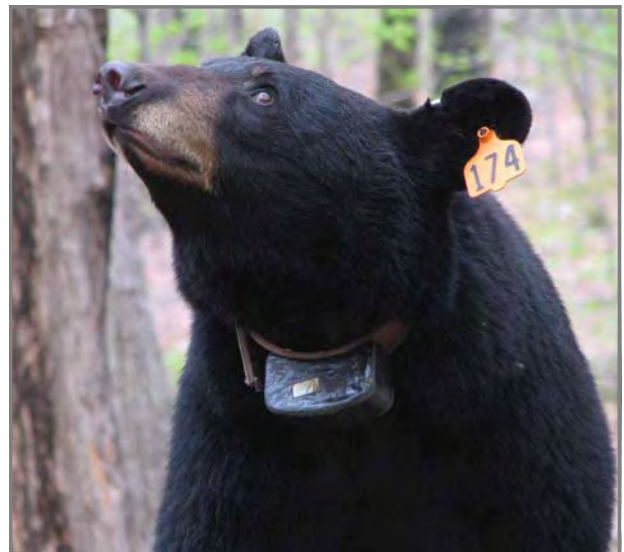
NJDFW agents killed this mother bear, orphaning two cubs.

In my own study area in Minnesota, my capture-recapture data produced population estimates that were double to triple the actual population. These discrepancies in my own data set were revealed when I placed radio-collars on the bears and found that I had been sampling bears from a much larger area than I thought. There is a need for additional radio-tracking and field study in New Jersey. McConnell's data set is growing old, and the population estimates from Carr and Burgess provide an