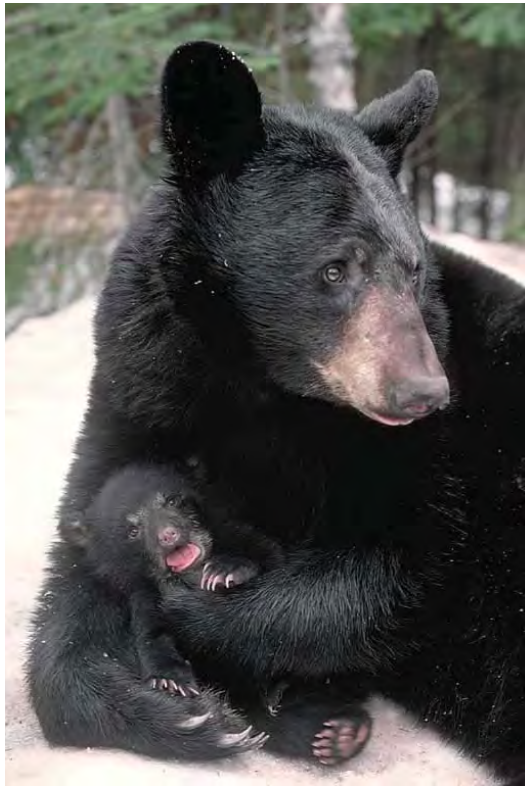
Mother bear with newborn cub.