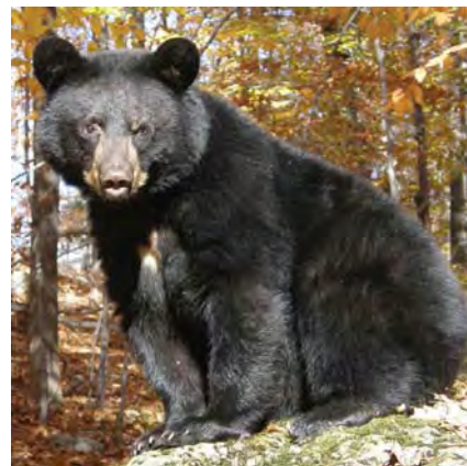
A New Jersey black bear. To increase hunter success, game biologists are meeting with bear hunters, and, via PowerPoint presentations, identifying, precisely, black bear habitat in the state. Hunters use GPS devices to find and kill the bears.

In Pennsylvania, a thousand people per square mile live in a housing development called Hemlock Farms. The people there became knowledgeable about bears, developed realistic attitudes, and peacefully coexist with three bears per square mile. That bear density is probably triple the density of bears found anywhere in New Jersey and is a higher density than is found in any national park or national forest. The people there became knowledgeable about bears and accepted them. As people replace misconceptions with facts, they move past their fears and become more willing to coexist with bears. Complaints about bears often decrease as bear numbers