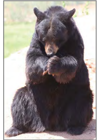
New Jersey black bear

Hunters pursue black bears for the kill, heads, and skins. “Many hunters have stated the view that they do not want the meat, they only want the hide and the current regulation discourages them from hunting black bears,” states the British Columbia Fish and Wildlife Branch. [59]