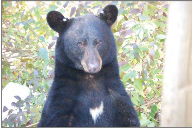
New Jersey female black bear, Sussex County, 2006

of the bears in outlying areas are young bears dispersing from the primary range. These bears roam widely, traveling many miles before settling. Thus, the effective area around the hair snares was likely larger than the 6.5 square miles claimed by the authors. Carr stated that some of the home ranges of females were less than 6.5 square miles and that some females that were within the supposed effective radius did not visit the baits and leave hair samples.