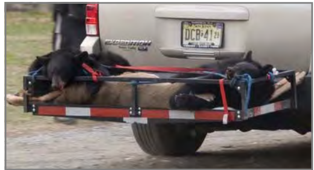
New Jersey: two cubs and a deer killed on Dec. 6, 2010.

The State closed the season in 1971 because there were no bears. From 1958 to 1970, through “regulated, scientifically sound,” hunting, the Division of Fish and Wildlife and the New Jersey Fish and Game Council successfully extirpated the black bear in New Jersey. Over 12 years, division staff permitted sport hunters to kill 46 bears, by bow and gun. [47] A 1981 division report cited 10 bear sightings in New Jersey. [48] As