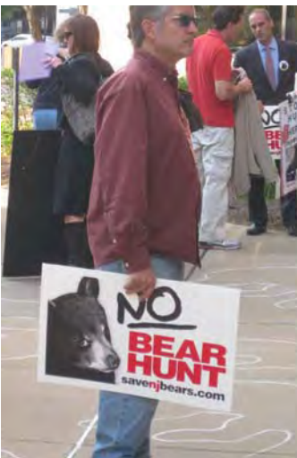
Bear supporters demonstrate in front of NJDFW headquarters in Trenton, November, 2011.