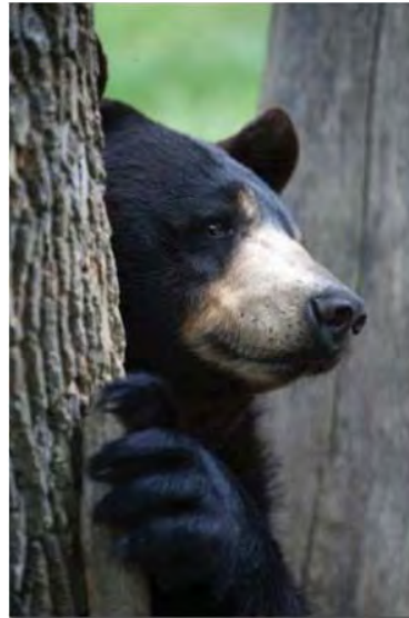
Eastern Kentucky black bear

In 2011, two years after the inaugural hunt, Dobey provided a public, if loose, estimate of “. . . less than 500 bears, — far fewer than the populations in its neighboring southern