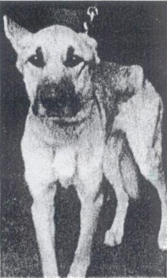
Left: A prime example of a dog given away "free to a good home".

The Society received a cruelty complaint concerning an emaciated dog kept in a Newark backyard under appalling conditions. An Animal Control Officer went to the scene and found a starving dog, without shelter, in a garbage-strewn yard, no area to walk, no bowl for water, no bowl for food...no one home who was concerned. The Society's Animal Control Officer confiscated the dog leaving a note who to contact for further information. No one ever called & we were unable to obtain the name of the person who would claim the dog as theirs. But the Society found a Verona, N. J. license and obtained the name and address of the licensee.