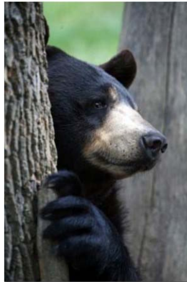
Eastern Kentucky black bear

In 2011, two years after the inaugural hunt, Dobe provided a public, if loose, estimate of “. . . less than 500 bears. — far fewer than the populations in its neighboring southern