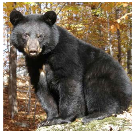
A New Jersey black bear. To increase hunter success, game biologists are meeting with bear hunters, and, via PowerPoint presentations, identifying, precisely, black bear habitat in the state. Hunters use GPS devices to find and kill the bears.

In Pennsylvania, a thousand people per square mile live in a housing development called Hemlock Farms. The people there became knowledgeable about bears, developed realistic attitudes, and peacefully coexist with three bears per square mile. That bear density is probably triple the density of bears found anywhere in New Jersey and is a higher density than is found in any national park or national forest. The people there became knowledgeable about bears and accepted them. As people replace misconceptions with facts, they move past their fears and become more willing to coexist with bears. Complaints about bears often decrease as bear numbers