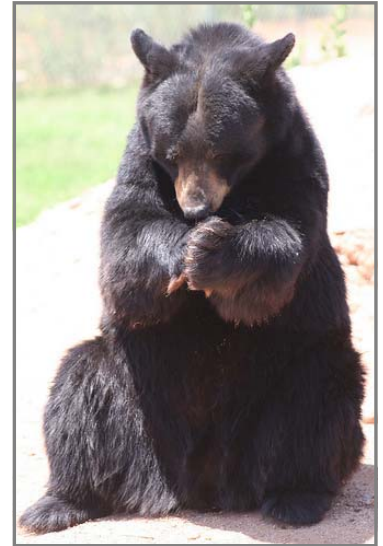
New Jersey black bear

Hunters pursue black bears for the kill, heads, and skins. “Many hunters have stated the view that they do not want the meat, they only want the hide and the current regulation discourages them from hunting black bears,” states the British Columbia Fish and Wildlife Branch. [59]