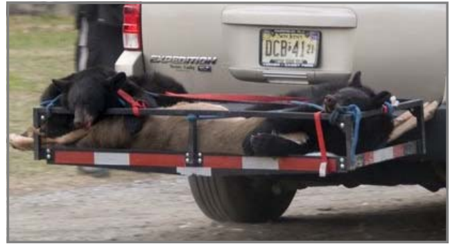
New Jersey: two cubs and a deer killed on Dec. 6, 2010.

The State closed the season in 1971 because there were no bears. From 1958 to 1970, through “regulated, scientifically sound,” hunting, the Division of Fish and Wildlife and the New Jersey Fish and Game Council successfully extirpated the black bear in New Jersey. Over 12 years, division staff permitted sport hunters to kill 46 bears, by bow and gun. [47] A 1981 division report cited 10 bear sightings in New Jersey. [48] As