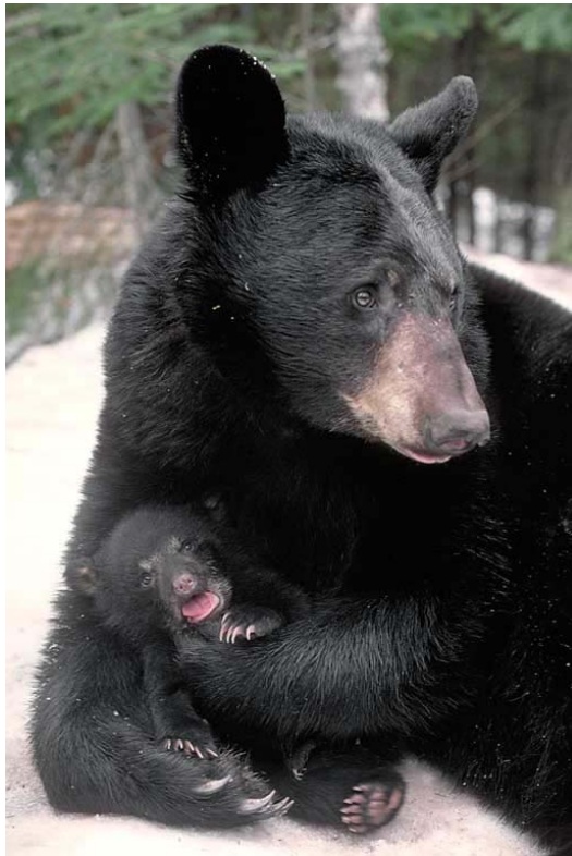
Mother bear with newborn cub.