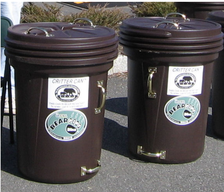
Bear-resistant trash bins, West Milford, New Jersey.

In New Jersey and Maryland, wildlife department spokespersons emphasize sport hunting as a means of separating bears and suburban residents and houses. Yet hunting officials elsewhere openly state what is common knowledge: