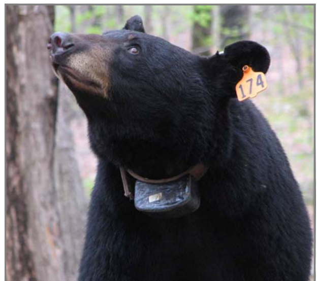
NJDFW agents killed this mother bear, orphaning two cubs.

In my own study area in Minnesota, my capture-recapture data produced population estimates that were double to triple the actual population. These discrepancies in my own data set were revealed when I placed radio-collars on the bears and found that I had been sampling bears from a much larger area than I thought. There is a need for additional radio-tracking and field study in New Jersey. McConnell's data set is growing old, and the population estimates from Carr and Burgess provide