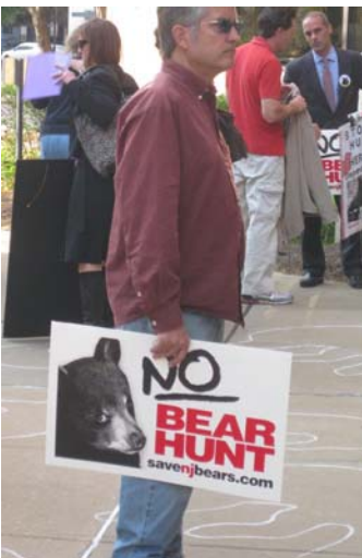
Bear supporters demonstrate in front of NJDFW headquarters in Trenton, November, 2011.