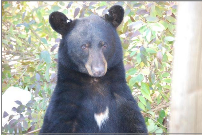
New Jersey female black bear, Sussex County, 2006

of the bears in outlying areas are young bears dispersing from the primary range. These bears roam widely, traveling many miles before settling. Thus, the effective area around the hair snares was likely larger than the 6.5 square miles claimed by the authors. Carr stated that some of the home ranges of females were less than 6.5 square miles and that some females that were within the supposed effective radius did not visit the baits and leave hair samples.