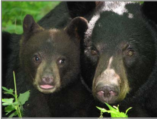
Black bear mother with one cub prior to 2010 New Jersey bear Hunt